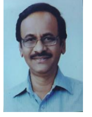
Sri.Y.Satya Narayana Municipal Commissioner Guntakal

Anantapuramu District, Govt. Andhra Pradesh.