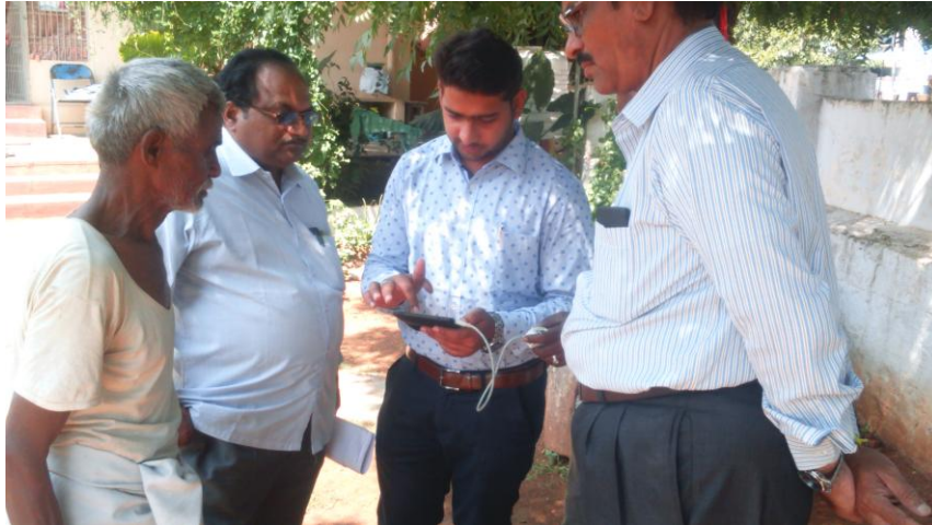
The above picture shows the field visit by the Municipal Commissioner, ACP and Master Trainer.

As part of the A.P state government initiative Smart pulse survey (Praja Sadhikara Survey) is being conducted in the town with 44 enumerators, till 30 th September 2016, Survey of 22,356 House holds is completed, the survey is being implemented at faster pace as it is high priority.