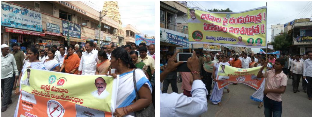
The above photograph depicts the Hon'ble MLA, Hon'ble Chair person, RDMA, Commissioner and Students participation in the rally.

During the program Hon'ble MLA, Hon'ble Chair Person, RDMA, Municipal Commissioner, CI of Guntakal police, Municipal Staff and 3000 students participated in the rally.